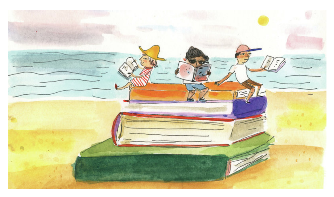
BHS English Department